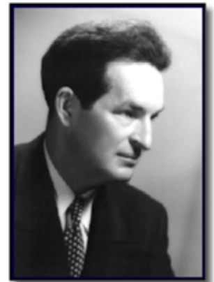
PAUL GREEN 1894-1981