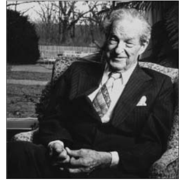
GREEN IN HIS LATER YEARS